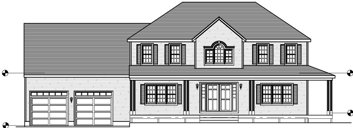
Colonial Design w/ 2 Car Garage

266 Park Street, North Attleboro, MA 02760 (508)294-3612 · www.packertdesign.com